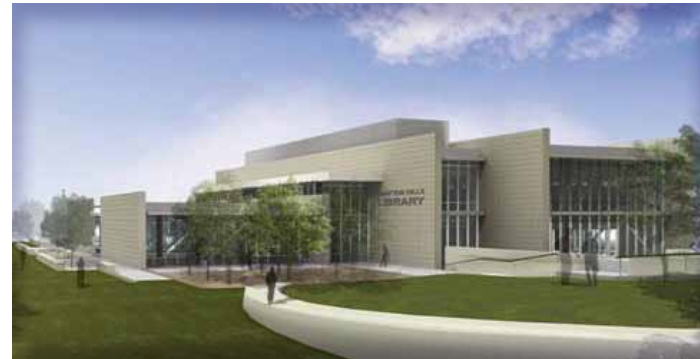
Learning Resource Center Rendering

The Learning Resource Center (LRC) will house functions located in the current Library/LRC, which include the Library, the Learning Center, and the Campus Data Center. It will become the central hub for the college's technology and audiovisual services and support. This facility will also house a 100-seat auditorium, an art gallery, and a multi-purpose room. Building foundations and structural steel framing are complete. Mechanical, electrical and plumbing systems rough-in is in progress. The estimated completion is May 2010.