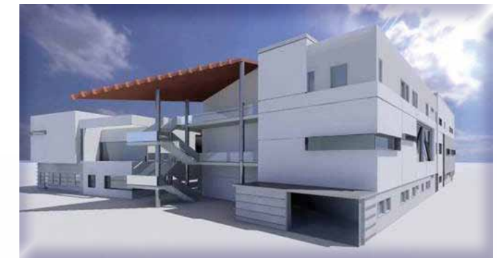
Science Building Rendering

The Science Building project is comprised of constructing a new building, site utilities/ infrastructure, landscaping, site paving, and demolishing the current Physical Science and Chemistry buildings. The new construction will be an inclusive science education building which includes lecture halls, classrooms, laboratories, special study areas for various subjects, and offices. Demolition is complete and site excavation is in progress. The estimated completion is April 2011.