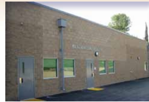
Completed M&O Building

March 2009 marked the completion of the Maintenance and Operations (M&O) project including constructing a new building, site utilities/infrastructure, landscaping, and site paving. Also included in this project was a smaller new building (M&O Custodial) with custodial and shop space, which was completed in April of 2009.