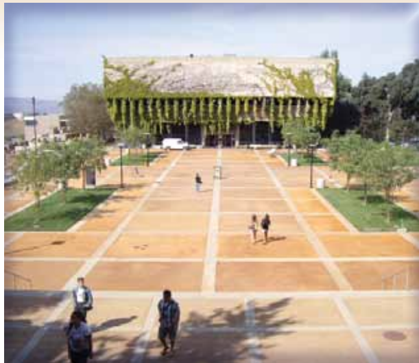
Completed Plaza, Package 2