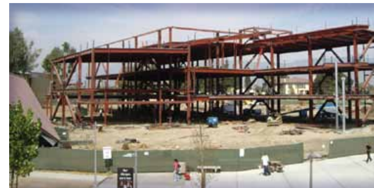
North Hall Steel Framing in Progress

The North Hall Replacement project is comprised of constructing a building to replace the current North Hall. The new general education building will have classrooms, special study areas for various subjects and offices. The new building's steel framing is complete. First floor framing is in progress. The estimated completion is March 2010.