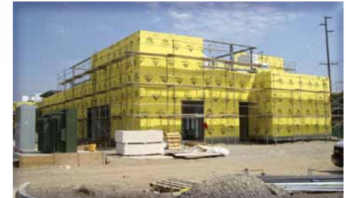
Media/Communications Exterior Wall Sheathing

The Media/Communications Building is comprised of constructing a single new building, site utilities/infrastructure, landscaping, and site paving. The new building will house a media broadcasting center (KVCR), as well as an education building which includes studios, program stage areas, assembly area, meeting rooms, library/tutoring rooms, and offices. Interior and exterior framing was recently completed. Exterior skin installation is complete. The estimated project completion is February 2010.