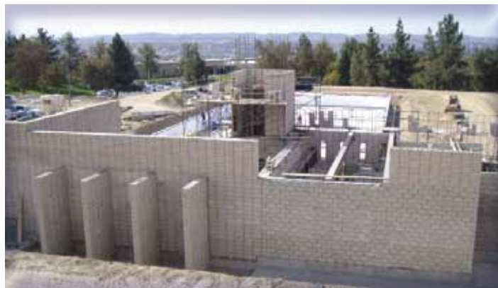
South View-CRF, Pool, & Masonry Walls

The Aquatic Center will provide a quality environment for learning and competition swimming. The project consists of an Aquatic Center, a 50 meter pool and surrounding site development, which will house lockers, showers, offices, storage, a multi-purpose room, pool, mechanical room, and related spaces. Site development includes a parking lot, landscaping and building access. The Myrtha pool foundation and base slab are complete. The pool building foundation, steel erection, and exterior are also complete. The estimated project completion is April 2010.